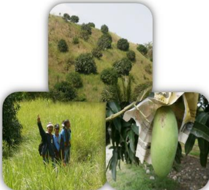
On-going Low Monitoring Survey (LMS) for MPW and MSW