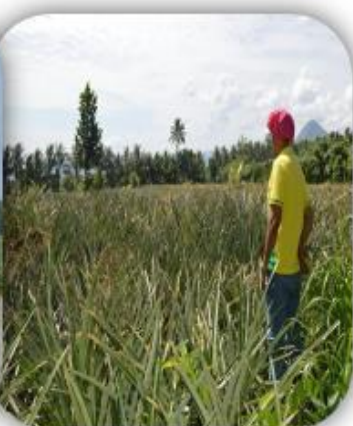
Pineapple Farm, Dole Polomolok South Cotabato