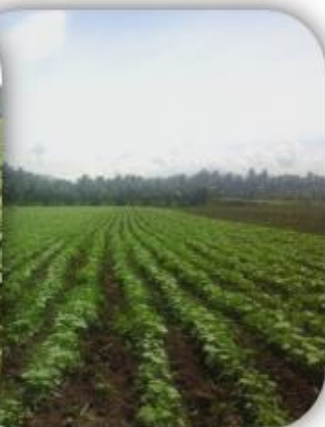
Okra Farm at Koronadal , South Cotabato