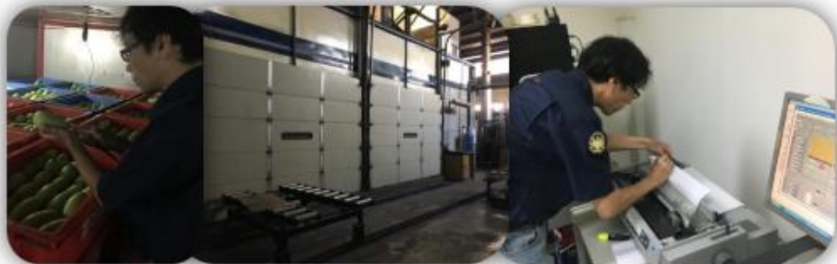
Vapor Heat Treatment