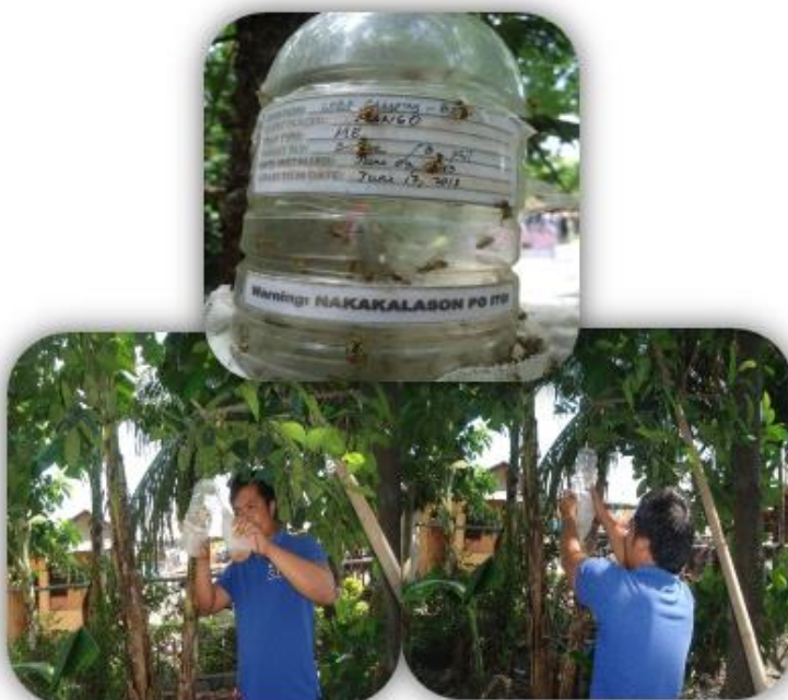
Fruitfly monitoring in different regions